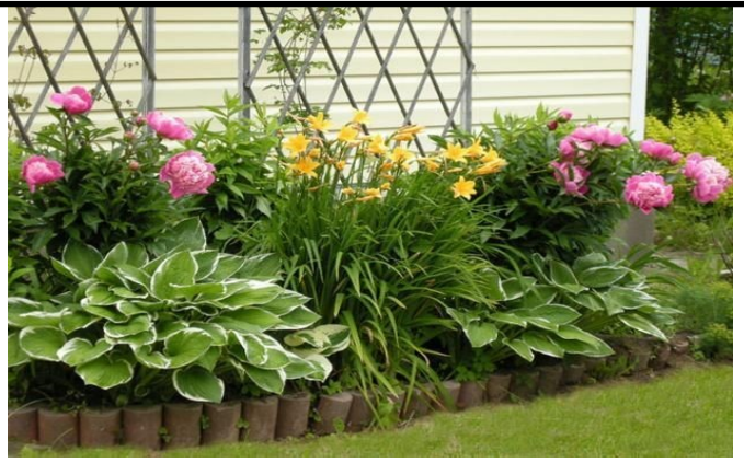
Edmondson Heights Neighborhood Annual Summer Garden Contest results!!!!

The Edmondson Heights Civic Association, Inc. would like to recognize the gorgeous gardens and lawns that beautified our neighborhood this year. The winners of this year's contest are listed below: